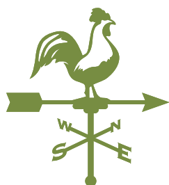
WEATHER / WIND